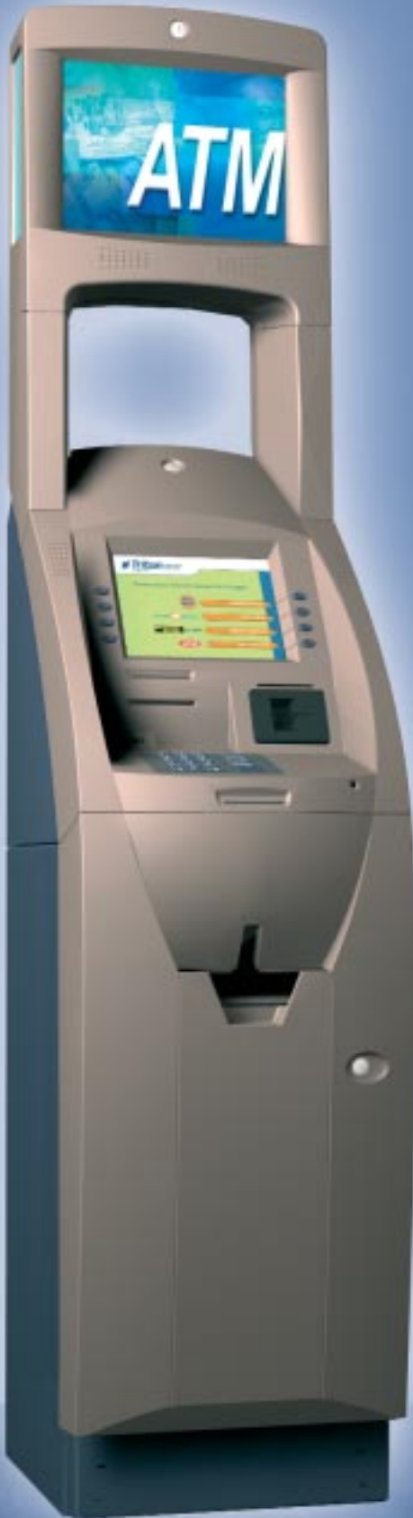
RL5000 with high topper

Triton's PC-based RL5000 is changing the way people think about ATMs. The all-new model offers a stunning 10.4 inch LCD display and supports a long list of value-added transactions. All at a much lower price point than other PC-based machines.